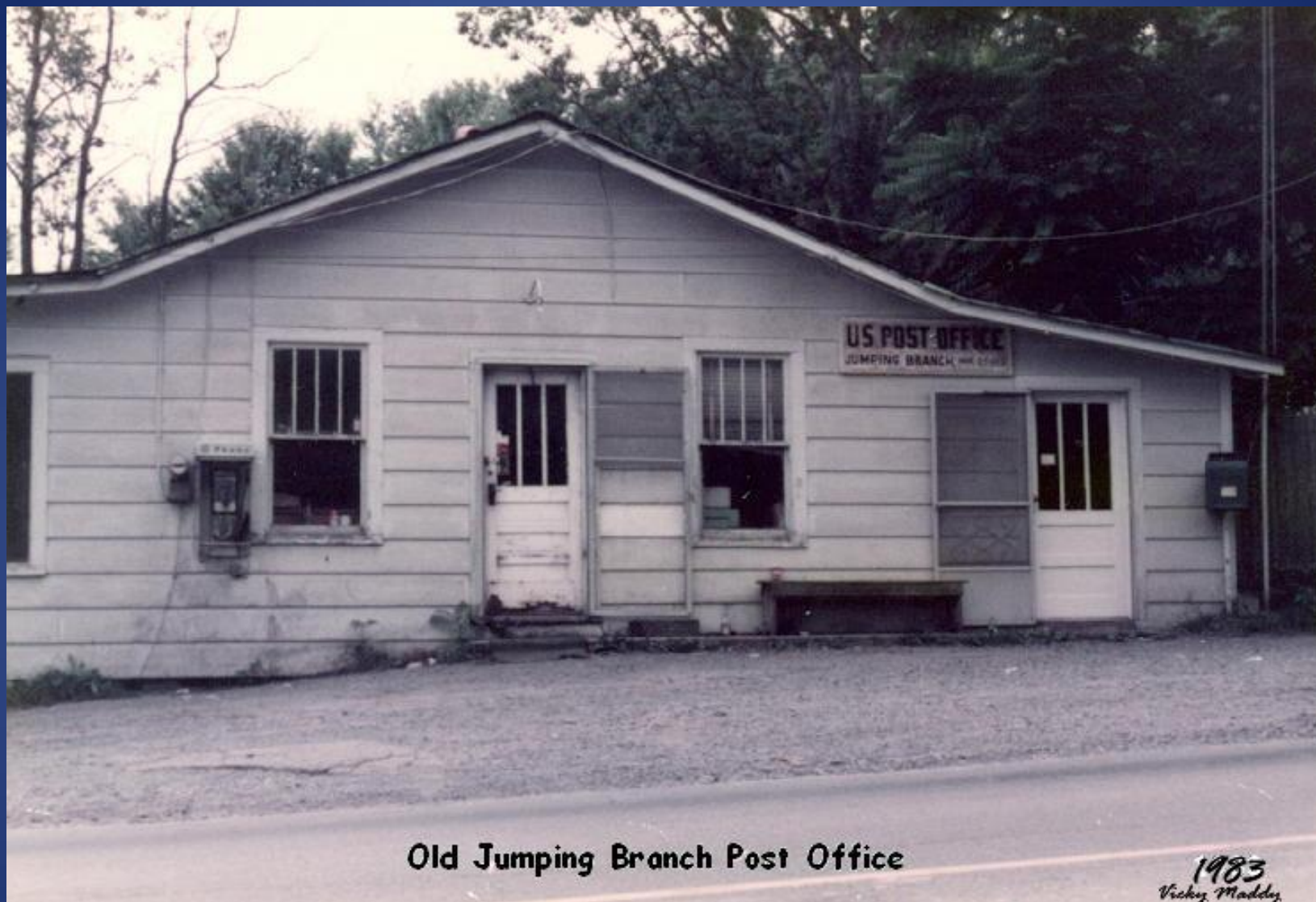
Old Jumping Branch Post Office