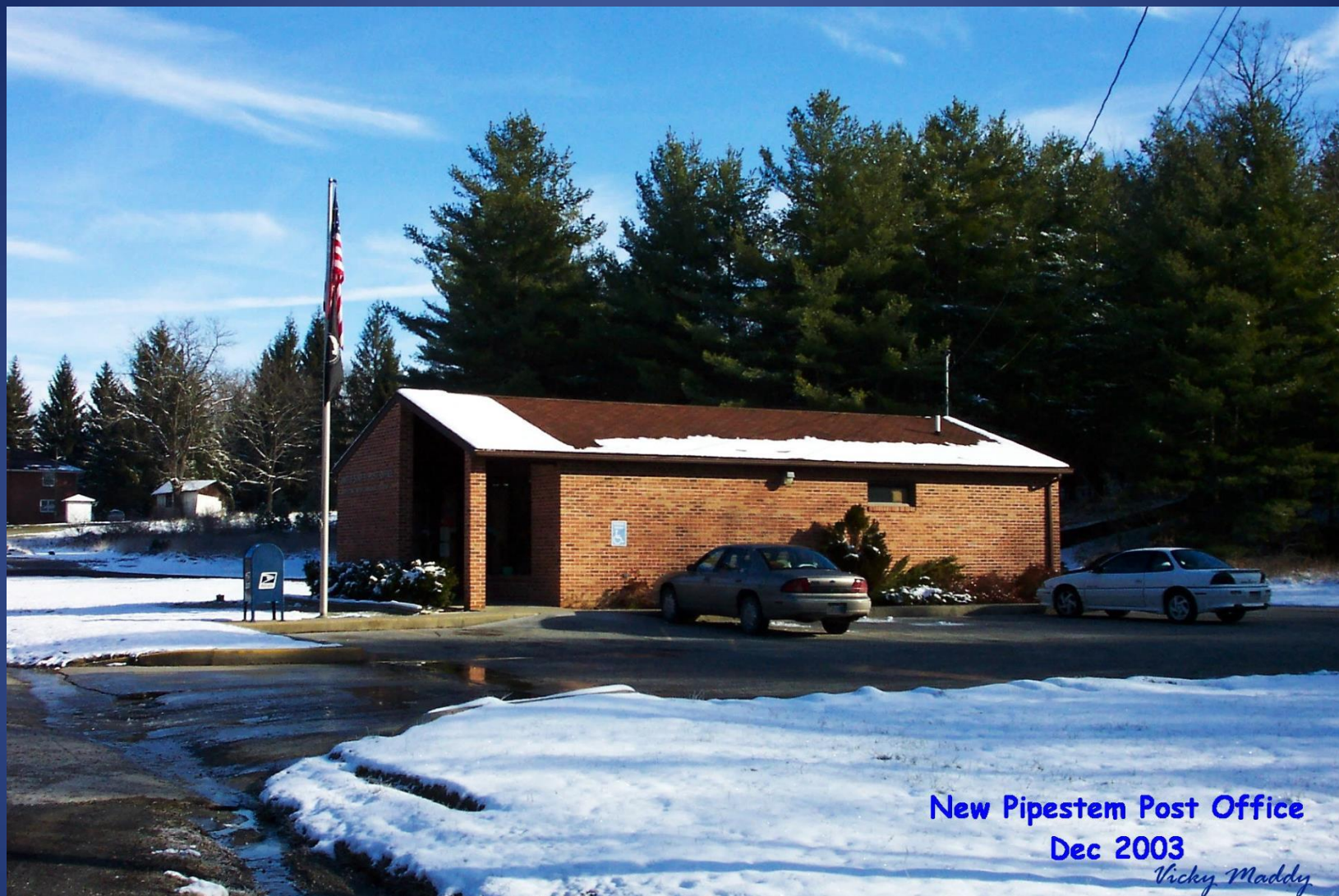
New Pipestem Post Office Dec 2003