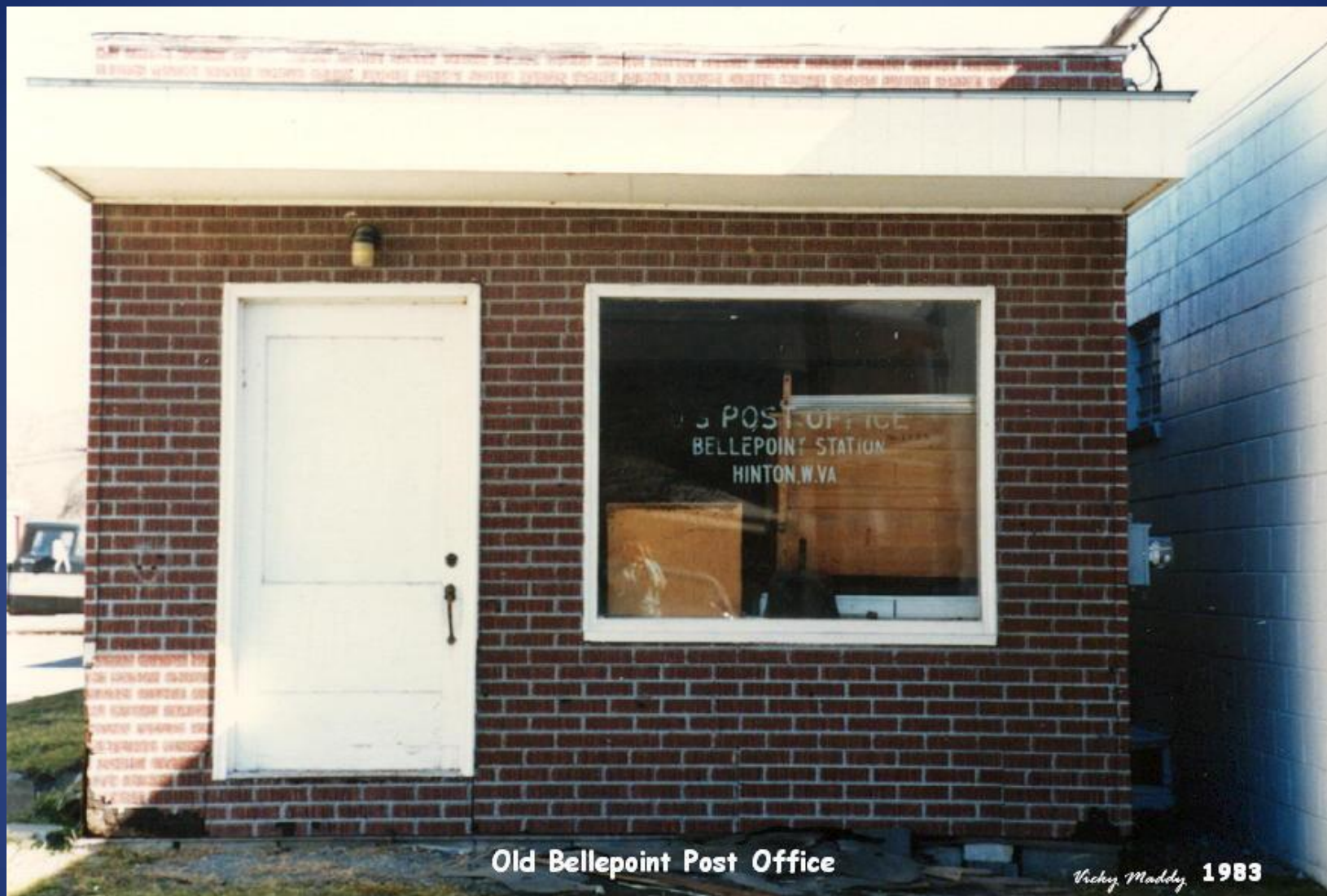
Old Bellepoint Post Office