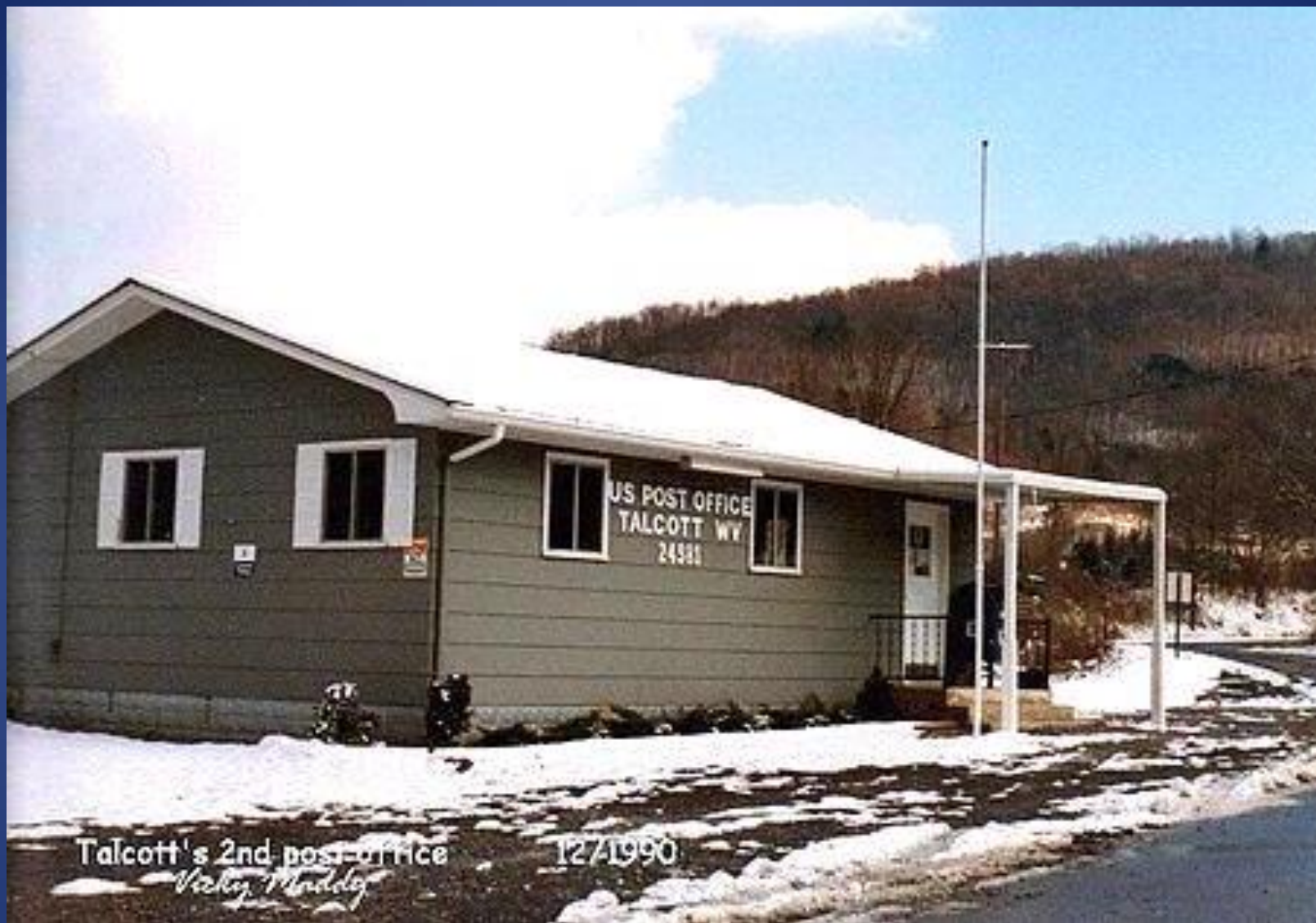
Talcott 2nd – Zip Code 24981 1990