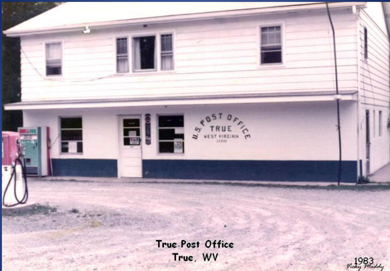
True Post Office True, WV