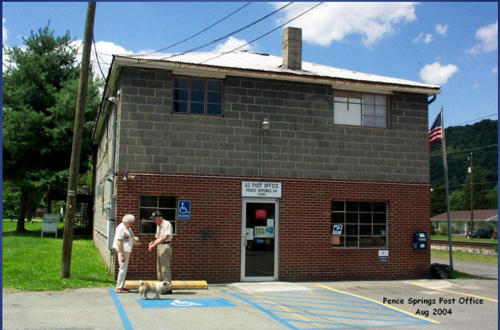
Pence Springs – Zip Code 24962 2004