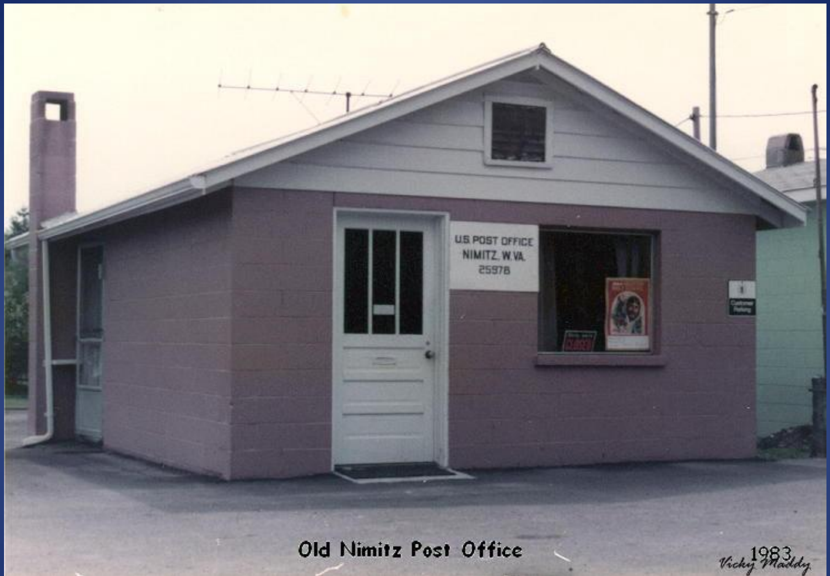
Old Nimitz Post Office