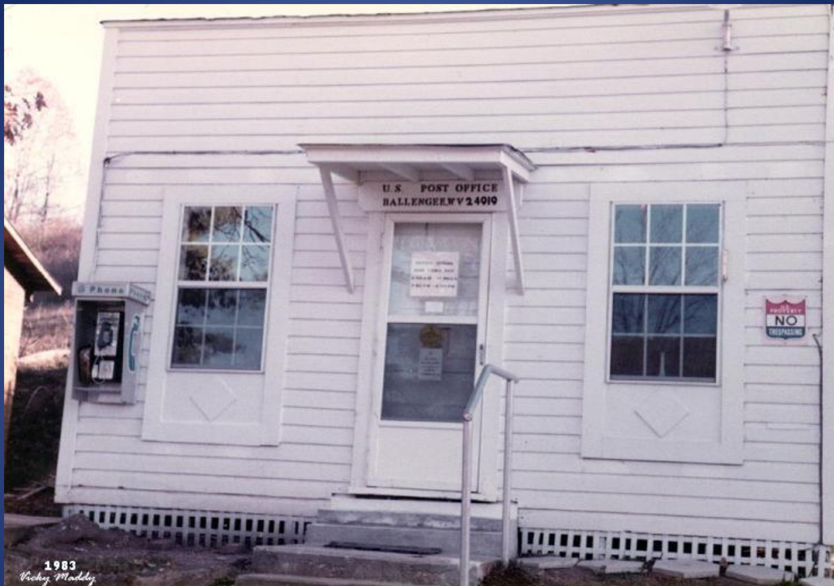
Ballengee – Zip Code 24919 1983