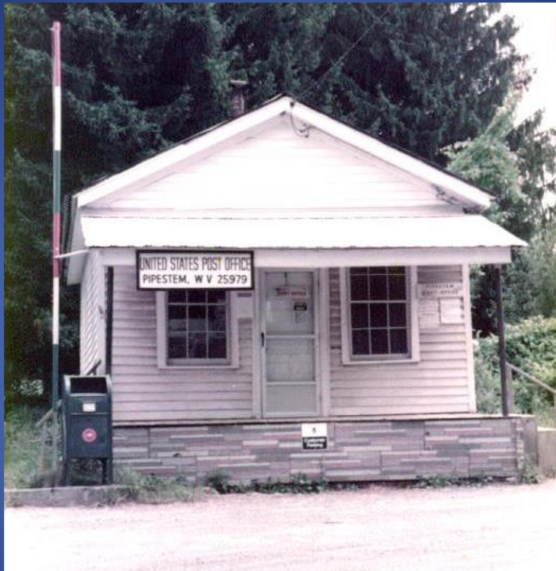
Old Pipestem – Zip Code 25979 1983