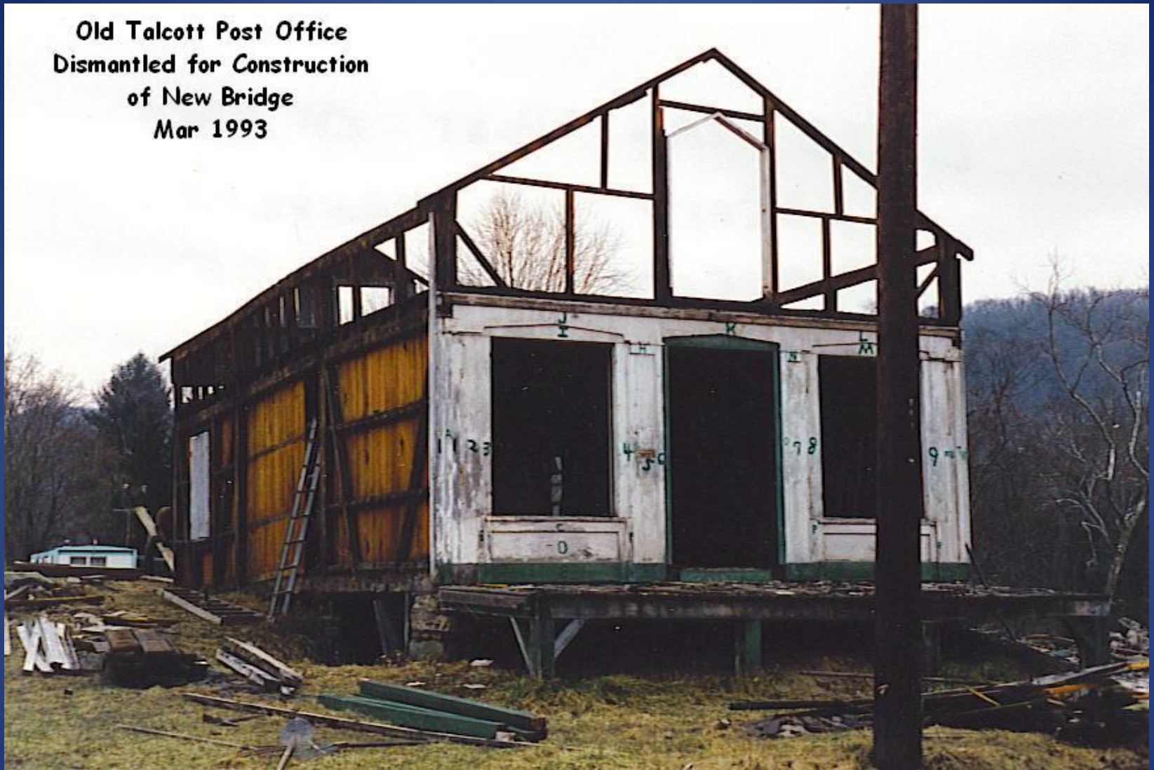
Old Talcott Post Office Dismantled for Construction of New Bridge Mar 1993