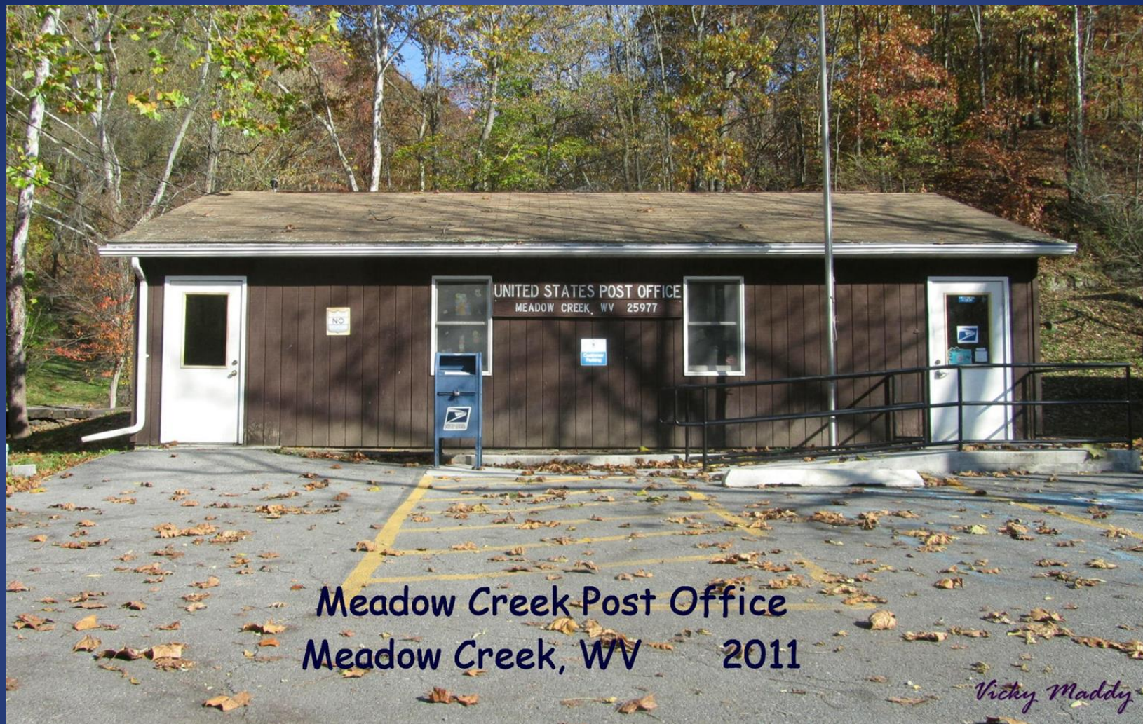
Meadow Creek Post Office Meadow Creek, WV 2011