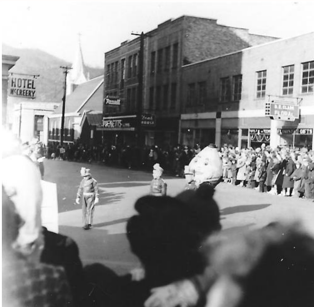
Christmas Parade Humpty Dumpty and Toy Soldiers Circa 1953