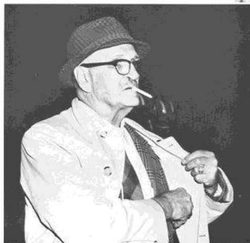
AT THE GAME —